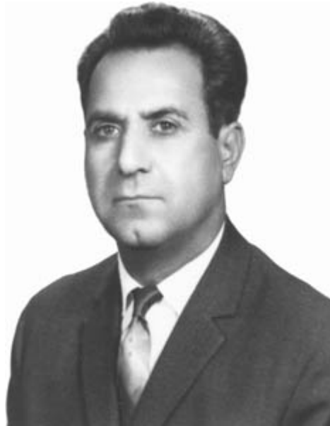
A 1950's photo

In 1953, after the coup in Iran, his home and the office of his weekly newspaper "Toofan-e-Joonoob" (The Storm of the South) were plundered and set on fire. He was then sentenced to death by a military court. Fortunately, the sentence was not confirmed and he was instead exiled to the city of Kerman. He was thus forced to retire from training and education and subsequently lived on growing an orchard. During this time, he wrote and translated thirteen books (of which most have been published), was the host of a radio program in Shiraz and authored many articles that appeared in newspapers of the time.